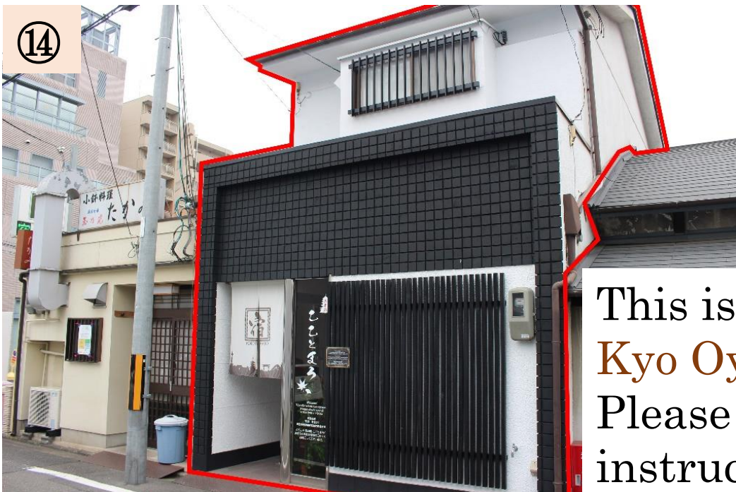
This is Kyo Oyado Kokotomaro ! Please check the other instruction and enter the room 😊