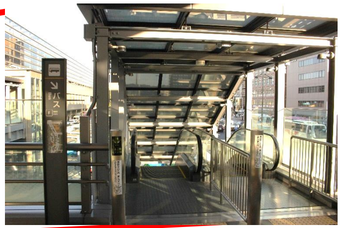
Please turn left and go downstairs.