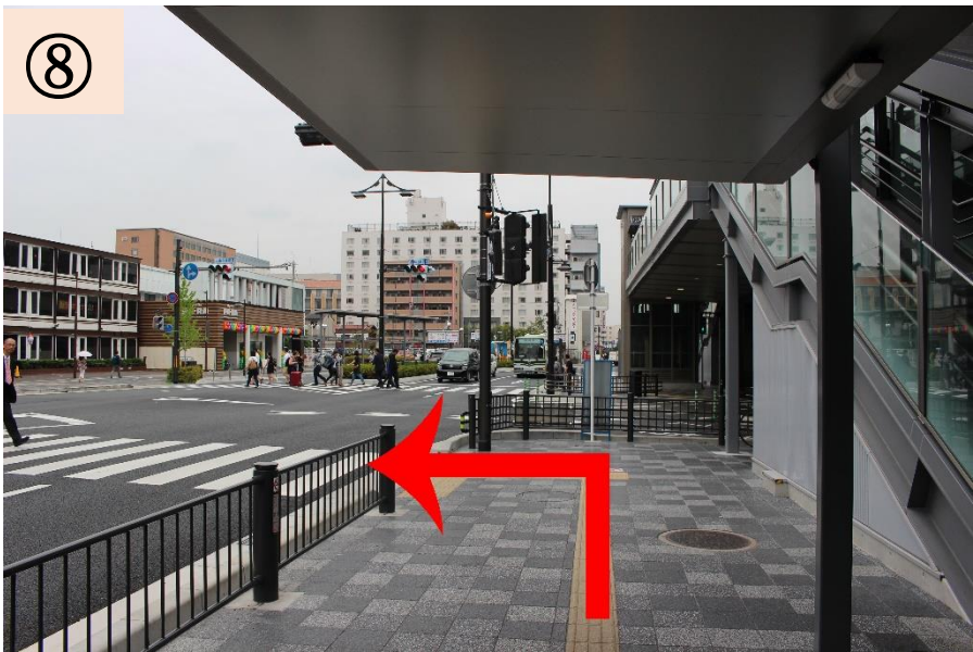
Turn left and go straight